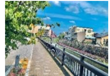
On the way to campus

There are supermarket, convenience store, bank, and post office near by.