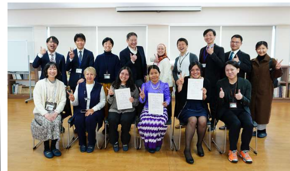
Completion Ceremony of Teacher Training Program