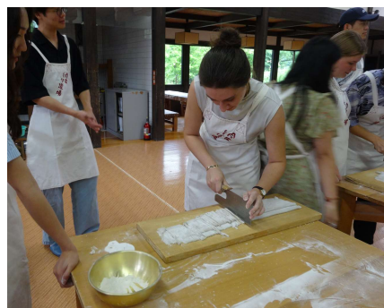
Japanese Culture Experience (Soba noodle cooking experience)

• Information for daily life and commuting time The Overseas Student House is located within 7mins walk from the campus. It takes 3mins to walk to the closest train station. There is a supermarket, convenience store, bank, and post office nearby.