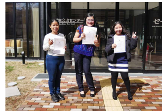
Completion of Intensive Japanese Program

Japanese Language Subjects Japanese Culture Experience Research Required for Completion Research Exercises Required for Completion.